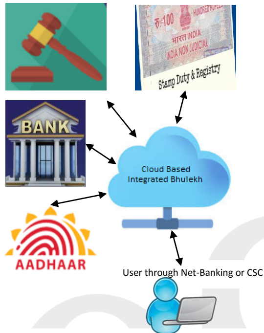
Figure 2: Integration Model of Cloud based Bhulekh

share from every ROR delivery. Also, the RORs available in public domain, and citizens/banks/others may check updated ROR details from upbhulekh.gov.in over the internet to reduce the cases of fraud in loans.